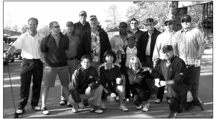
Golfers at the UPCS Annual Golf Challenge pose before heading out to play 30-plus holes to raise money for our youth and programs.