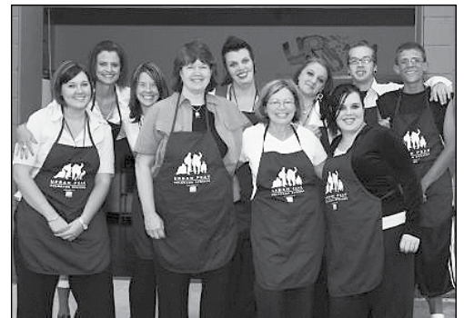
On a beautiful summer morning, staff, volunteers and youth helped serve breakfast for more than 150 guests at our first "There's No Place Like Home" Community Breakfast!