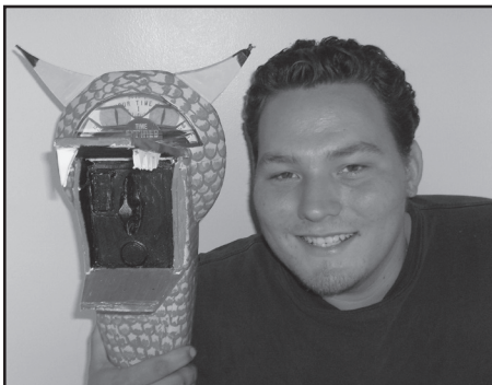
Youth at UPCS next to one of the Miracle Meters.

Ownership of the Miracles Meters program been transferred from Homeward Pikes Peak to Urban Peak Colorado Springs. The program features 100 parking meters placed throughout the city which have been creatively decorated by clubs, companies, artists, and others, and which the community can fill with money now benefitting the homeless youth of Urban Peak Colorado Springs.