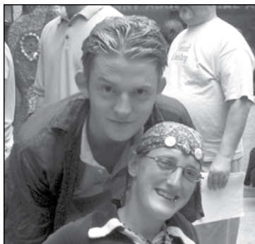
(L) Urban Peak youth before they perform at an Art from Ashes public event. (Below) Youth writing in class at UP. "Using the creative power of words for hope and healing" is the foundation of Art from Ashes.