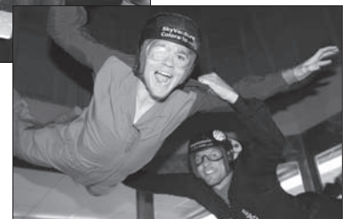
Youth at Friday Fun Day at SkyVenture.

Many youth have also participated in Friday Fun Day, when they have gone rock climbing, touring Red Rocks, and skydiving at SkyVenture.