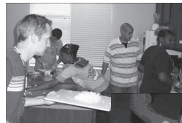
Youth and staff in cooking class.