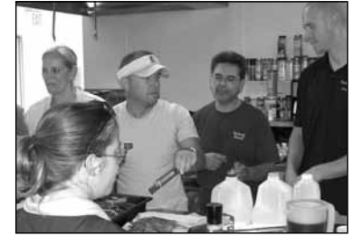
Volunteers from Room & Board serve Community Breakfast at the Shelter.

And they continue to seek more ways to give! We are so grateful for the kindness and generosity of this outstanding group of people. Thank you, Room & Board!