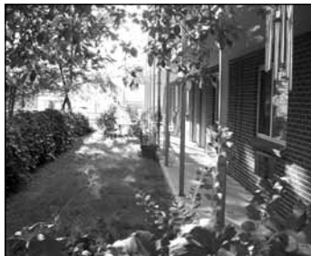
Outside Rowan Gardens Apartments.

Our Family Unification Program (FUP) was created for young people who were in the custody of the Department of Human Services at age 16 or older and who are currently between 18 and 22 years old. It is designed to assist youth with a supportive transitional housing program that bridges the gap between social services and independent living.