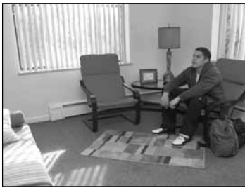
Youth at Rocky Mountain Youth Housing.

The goal of the program is to teach young people to sustain housing and to improve their independent living skills in a stable, supportive environment. Rocky Mountain houses up to 35 young people, ages 16-23, in a single apartment complex. The length of the program is 18 months. Most youth are working or in school full time (or part time in both) and most exit the program into their own apartments in the community.